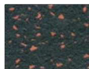
NO. 109 RED