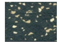
NO. 177 COCOA/EGGSHELL