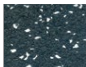
NO. 125 GREY