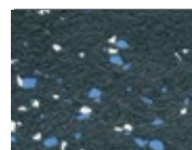
NO. 122 BLUE/GREY