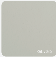
F6031-87 DOVE GREY