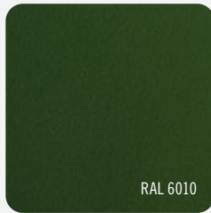
F6031-27 PUTTING GREEN