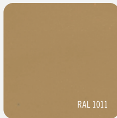
*F6031-65 CINNAMON TOAST