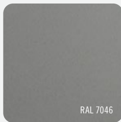
F6031-84 ASH GREY