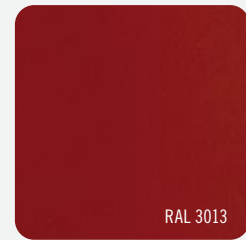
*F6031-19 CRIMSON RED