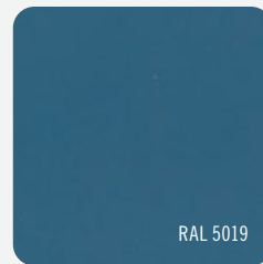
*F6031-441 COASTAL WATER BLUE