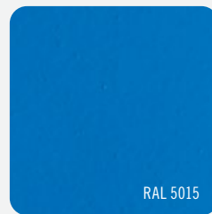
F6031-47 MOUNTAIN SKY BLUE