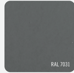
*F6031-801 BATTLESHIP GREY